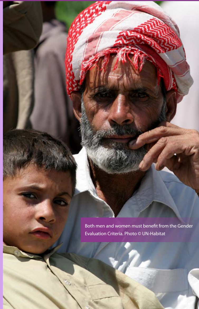
Both men and women must benefit from the Gender Evaluation Criteria.