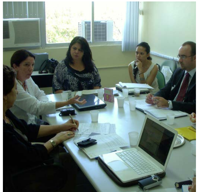
Local Committee in Recife using the Criteria.

At the World Urban Forum in Rio de Janeiro in 2010, it was announced that the area would not be evicted, and that a process of regularization would commence. It was also publically committed that a gender-responsive approach would be used, and that this would be ensured through the application of the Gender Evaluation Criteria throughout the regularization process. By using a gendered approach, the Local Committee (a multi-stakeholder forum constituting the federal agency that owns the land, the state agency responsible for the regularization, a research organisation and Espaço Feminista) can ensure that both women and men are not only beneficiaries, but social agents in the regularization process.